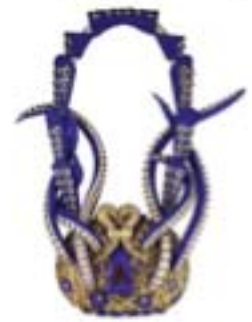
(above) Best Use of CRYSTALLIZED™ - Swarovski Elements Handbag (Use of crystallized – Swarovski Elements in a sketch): Aimee Kestenberg, Australia, Tammi Tales